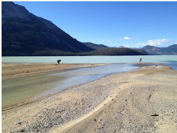
Mouth of Taseko Lake from Battlement Creek

Collectively as a team, another highlight that is worthy of mention is the 'no staking area' for online mineral exploration which now is recognized by the Province is a buffer to protect the T̓silhqot̓in watershed as a result of the teamwork of the Stewardship Fisheries department, TNG Biologist and the Province through COSEWIC – Candidate for Canadian Wildlife Species at Risk; protection measures to protect the ecosystem for steelhead. It was shared with me that last year's count for steelhead was only five. I had to make mention of it, as I ensure to utilize this data as an area for protection while responding to any proposed exploration activities. Let me know if you had any questions, I can be reached via email trina@tsilhqotin.ca or by phone (250) 302 – 3967; or in person at our new office location at 925 2nd Avenue, Williams Lake.