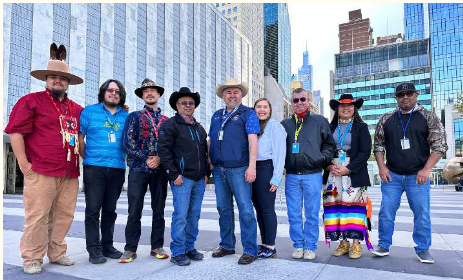
2023 T̓silhqot̓'in Delegation to the United Nations

The T̓silhqot̓'in voice is important – it must be heard at the level of the United Nations.