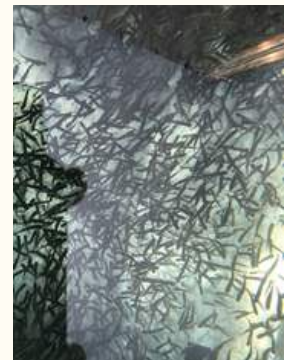
Right: Gwedes Che̱qox Ja̱s (Upper Chilcotin Chinook) fry ready to be released back into the river.